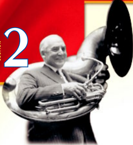
▲ President Harding joins a parade.